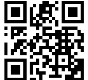
Go to https://www.nvon.org or scan this QR Code with your smartphone for more information about this organization.