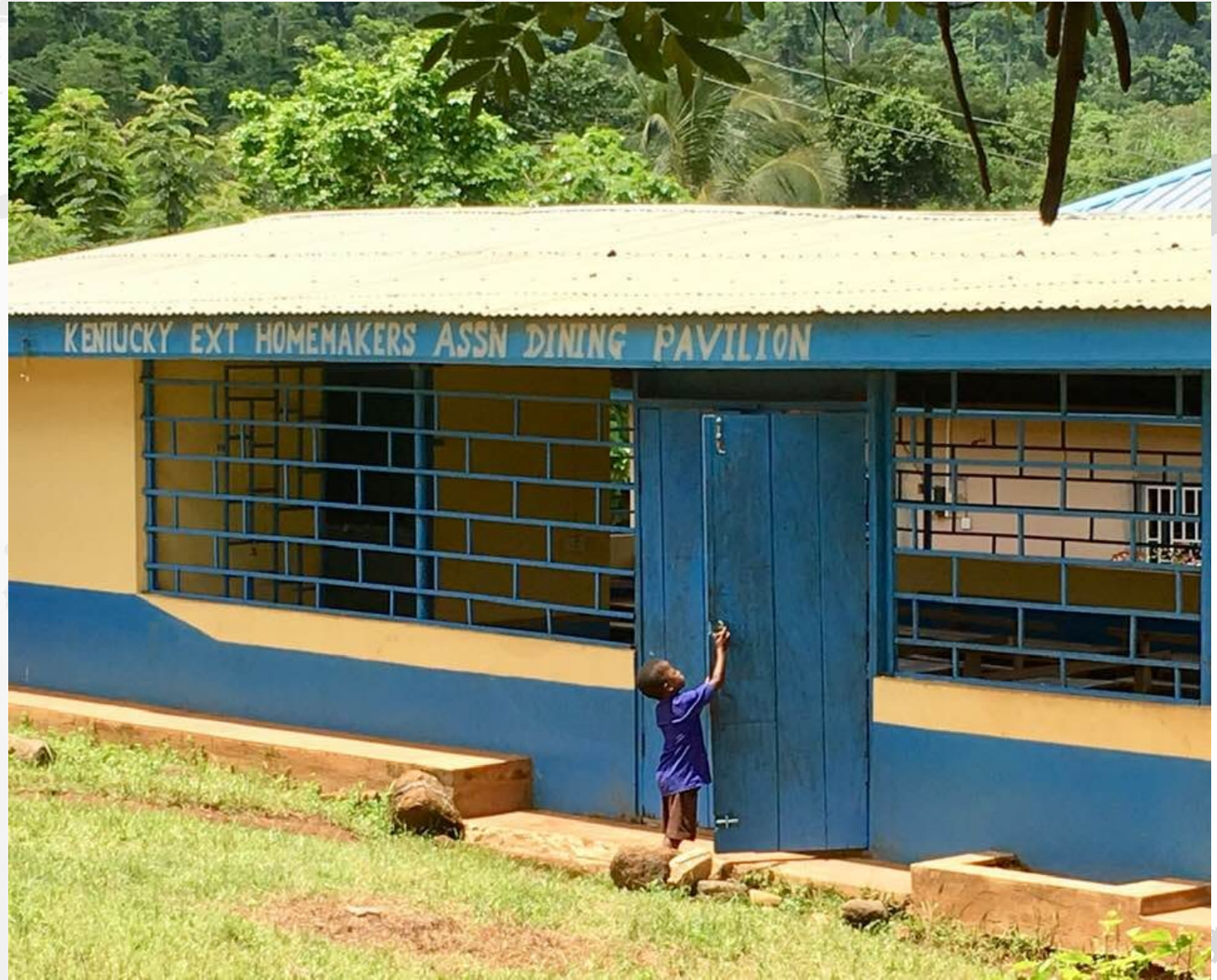
The Kentucky Academy School Feeding Program