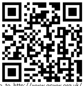
Go to http://www.acww.org.uk/ or scan this QR Code with your smartphone for more information about this organization.