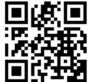
Go to https://www.nvon.org or scan this QR Code with your smartphone for more information about this organization.