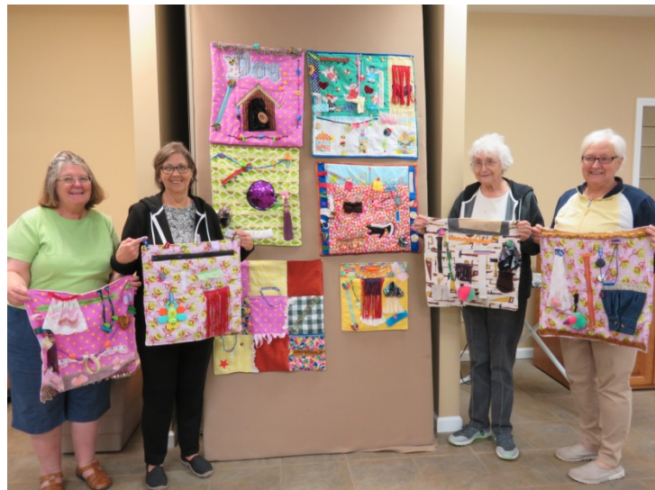
Samples provided by: Sassy Stitchers of Lincoln County