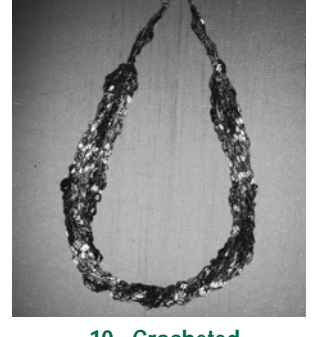
10. Crocheted Necklace— Multi-strand necklace made with trellis thread & beads. Must know how to do a crochet chain stitch.