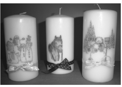
8. Stamped Designed Candles— Create your own one of a kind embossed candle.